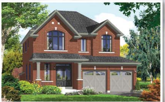
ELEV - B - 2415 sq.ft.