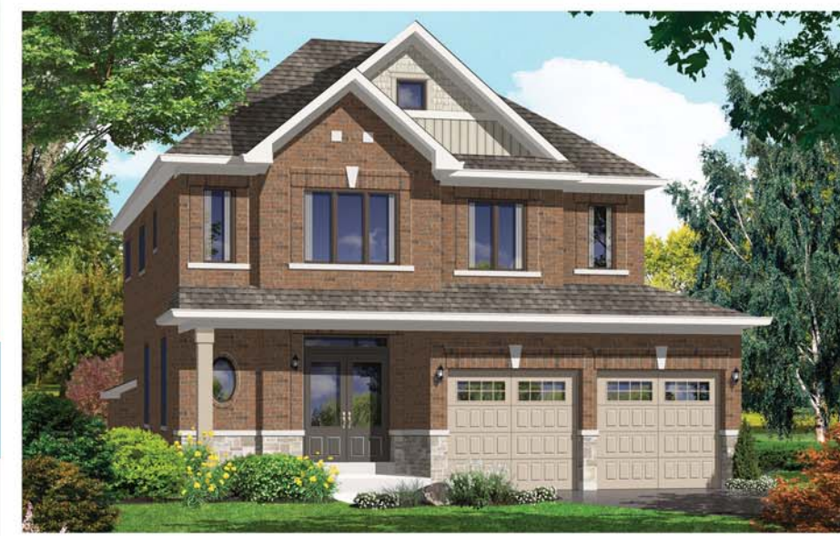
Elevation - C - 2424 sq.ft.