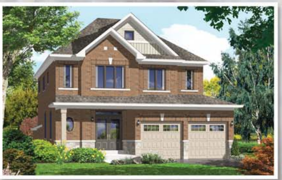
ELEV - C - 2424 sq.ft.