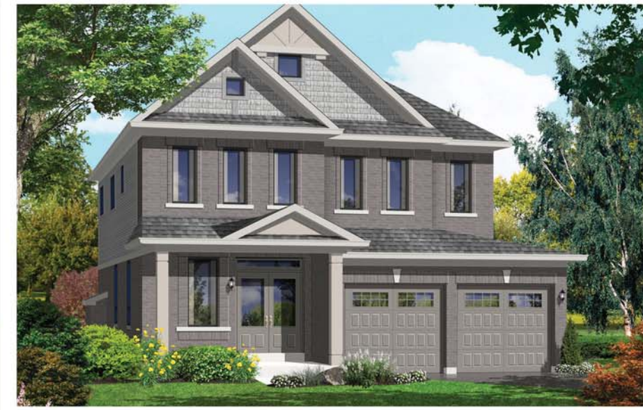
Elevation - A - 2413 sq.ft.