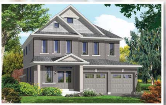
ELEV - A - 2413 sq.ft.