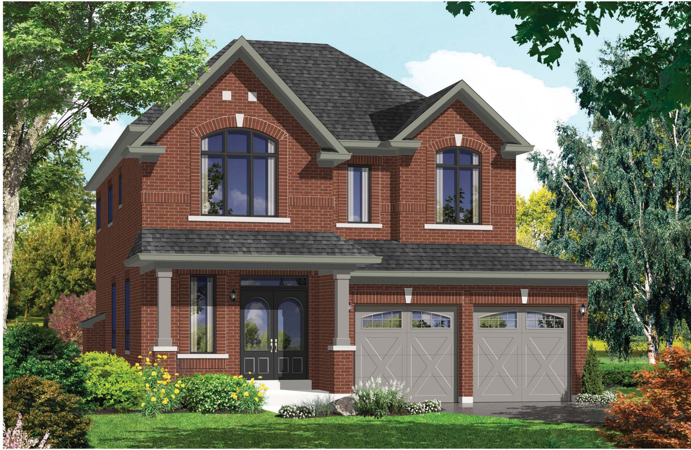
Elevation - B - 2415 sq.ft.