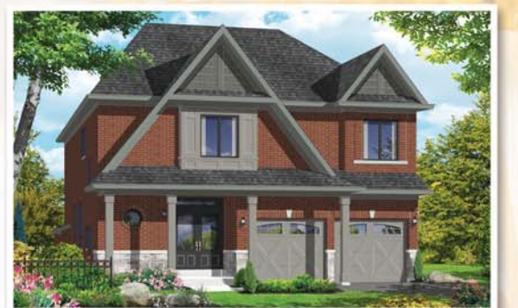
ELEV - A1 - 2826 sq.ft.