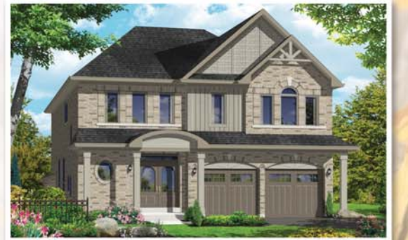
ELEV - B - 2822 sq.ft.