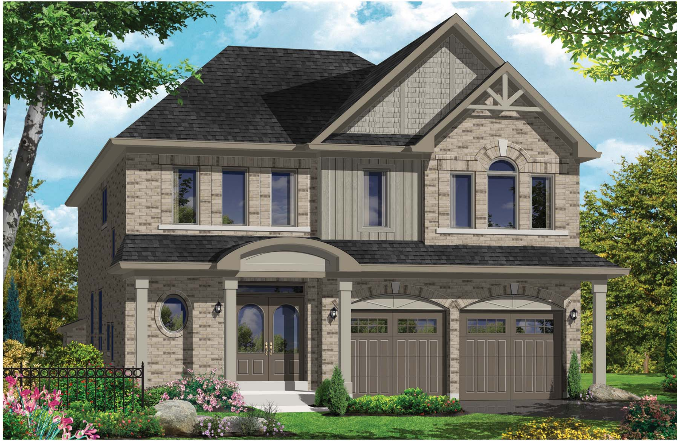
Elevation - B - 2822 sq.ft.