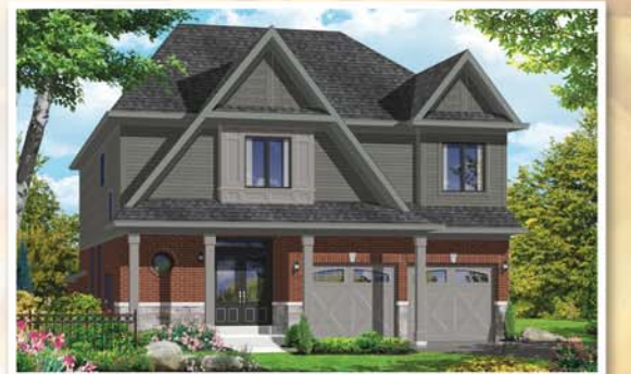
ELEV - A - 2826 sq.ft.