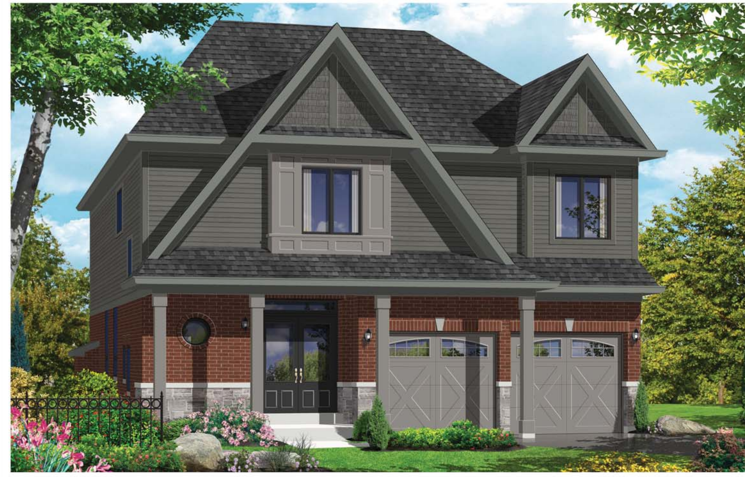
Elevation - A - 2826 sq.ft.