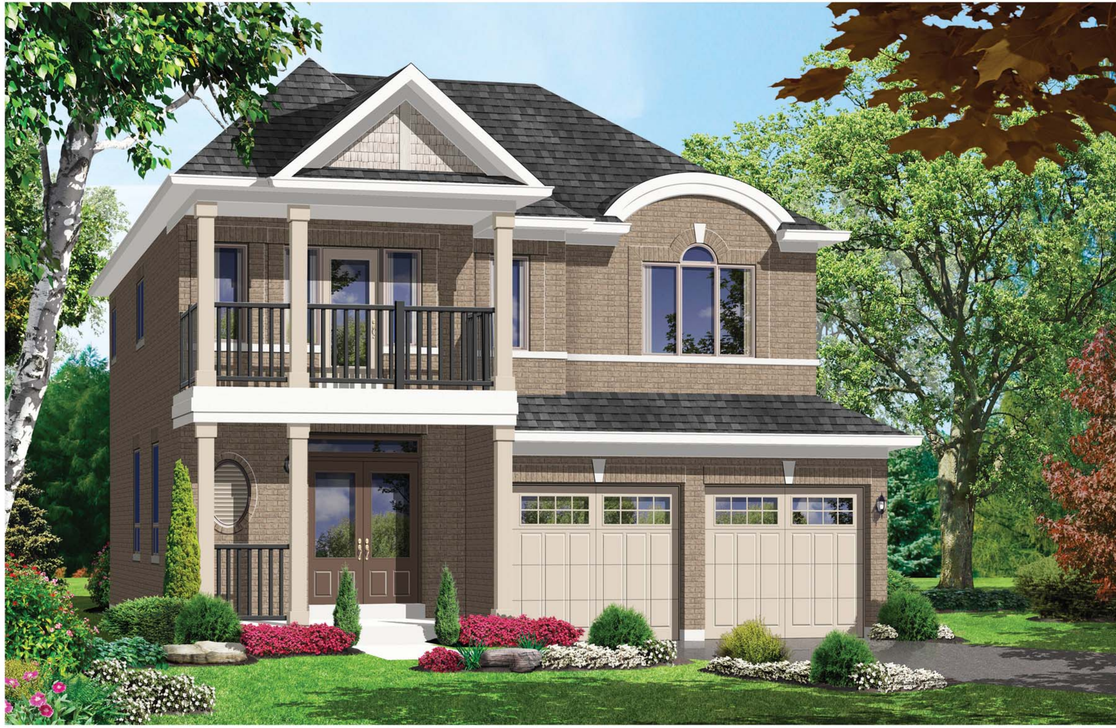
Elevation - B - 2259 sq.ft.