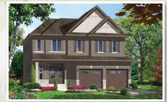
ELEV - A1 - 2295 sq.ft.