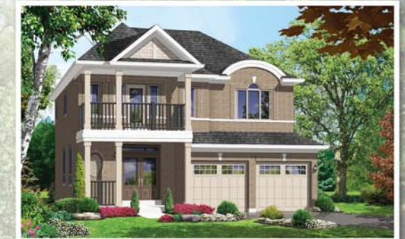
ELEV - B - 2259 sq.ft.