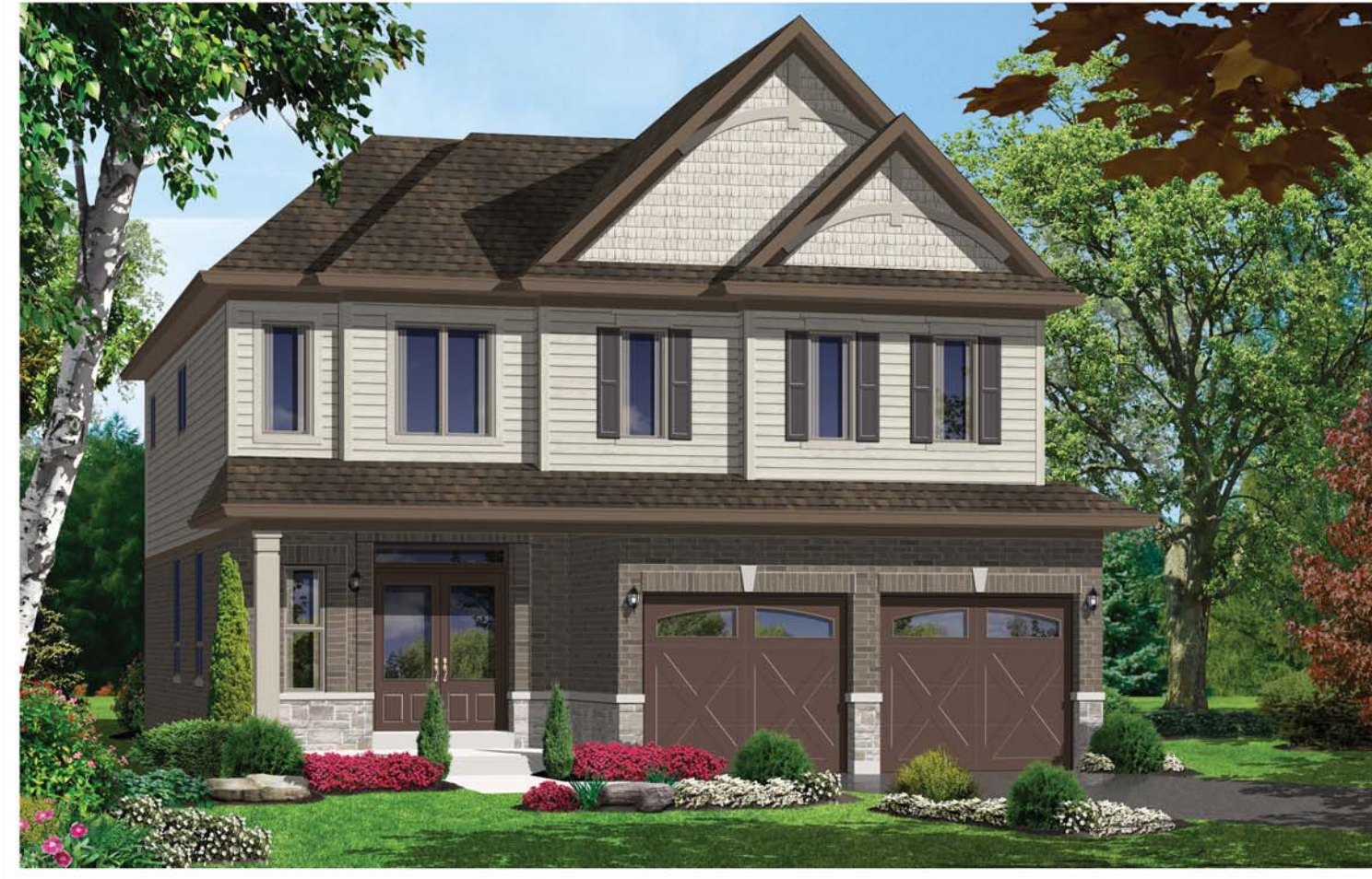
Elevation - A - 2285 sq.ft.