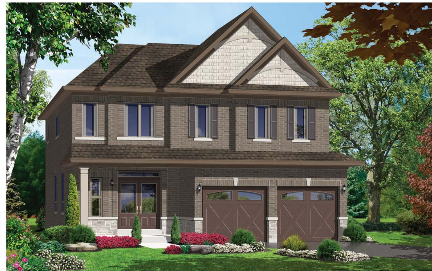
Elevation - A1 - 2295 sq.ft.