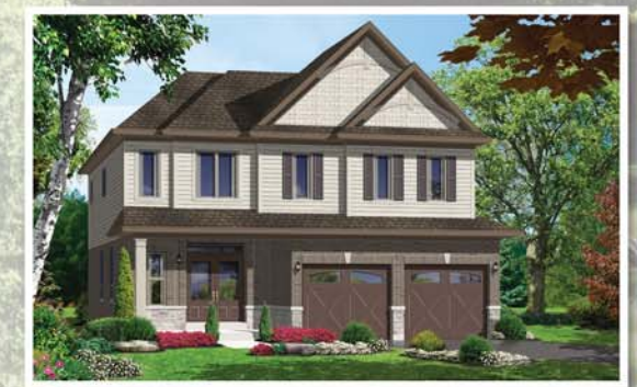
ELEV - A - 2285 sq.ft.