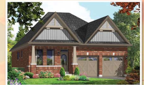
ELEV - B - 1866 sq.ft.