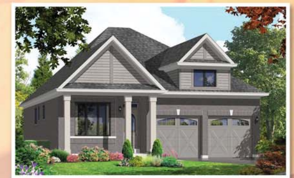
ELEV - A - 1866 sq.ft.