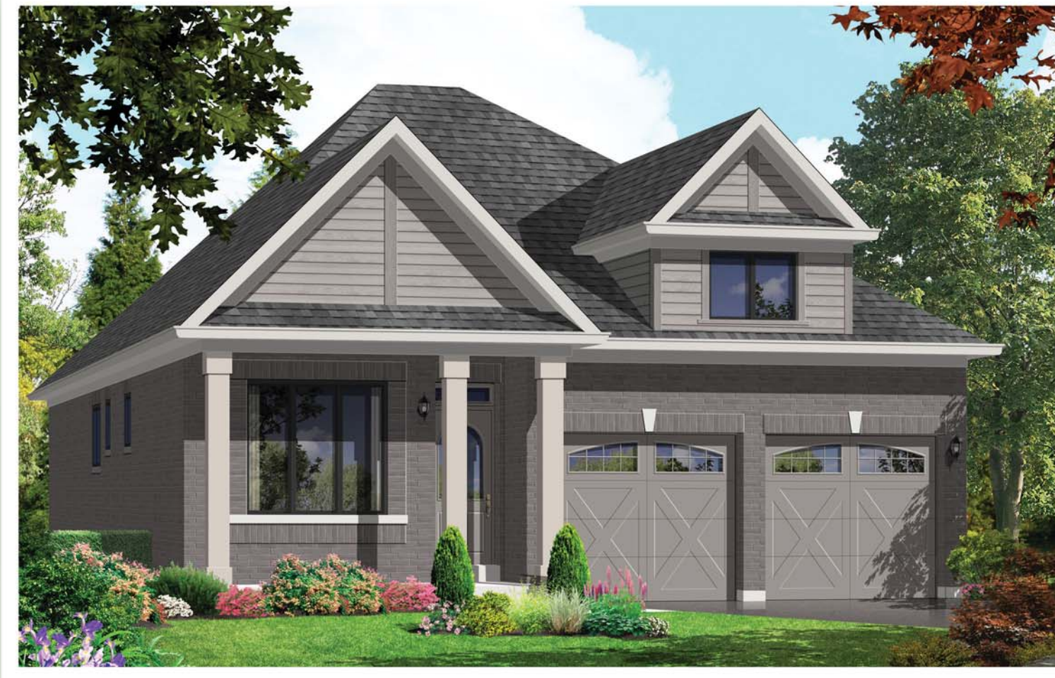
Elevation - A - 1866 sq.ft.