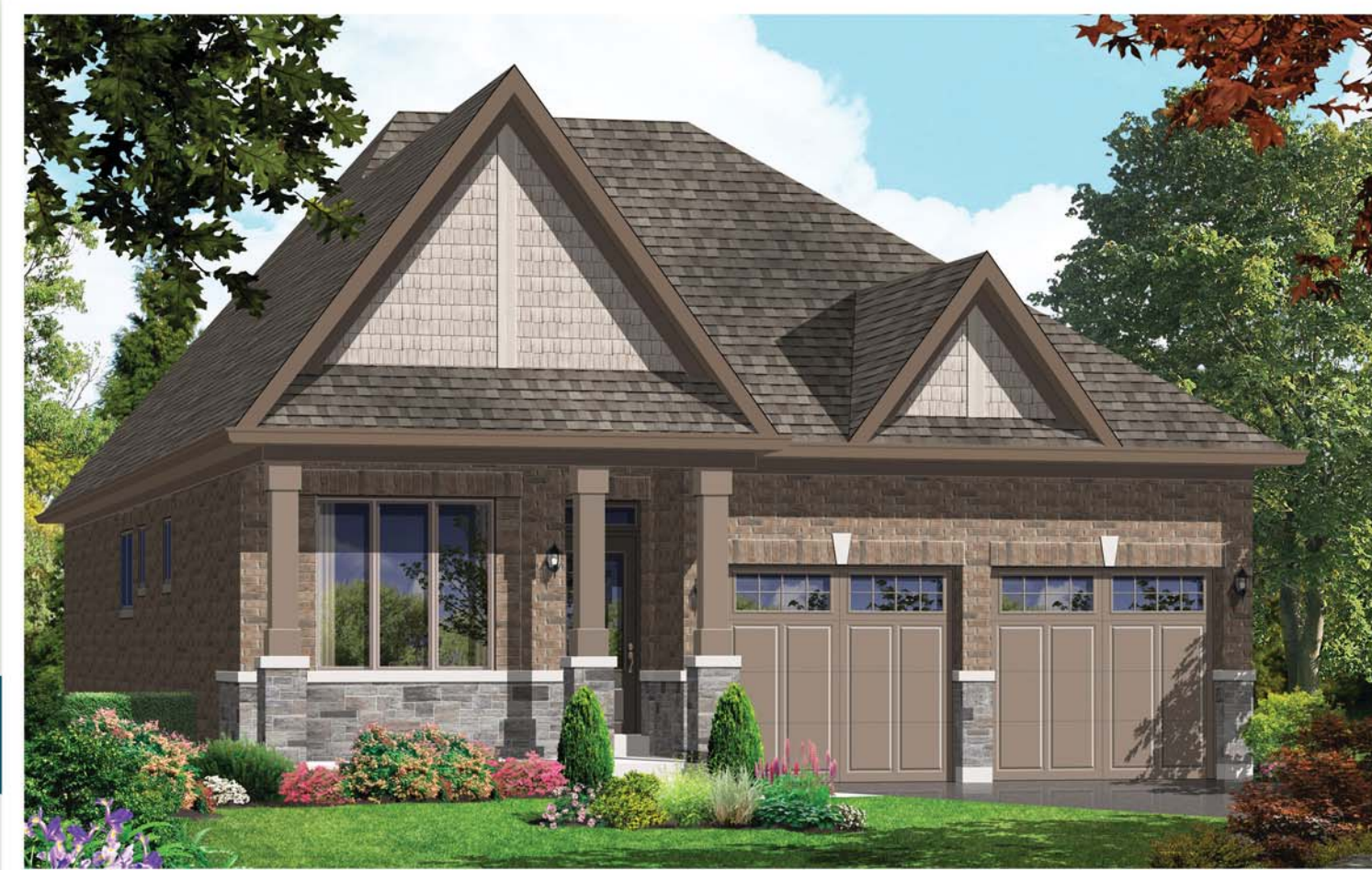
Elevation - C - 1866 sq.ft.