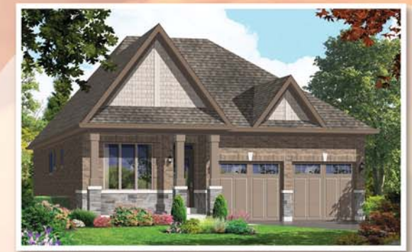
ELEV - C - 1866 sq.ft.