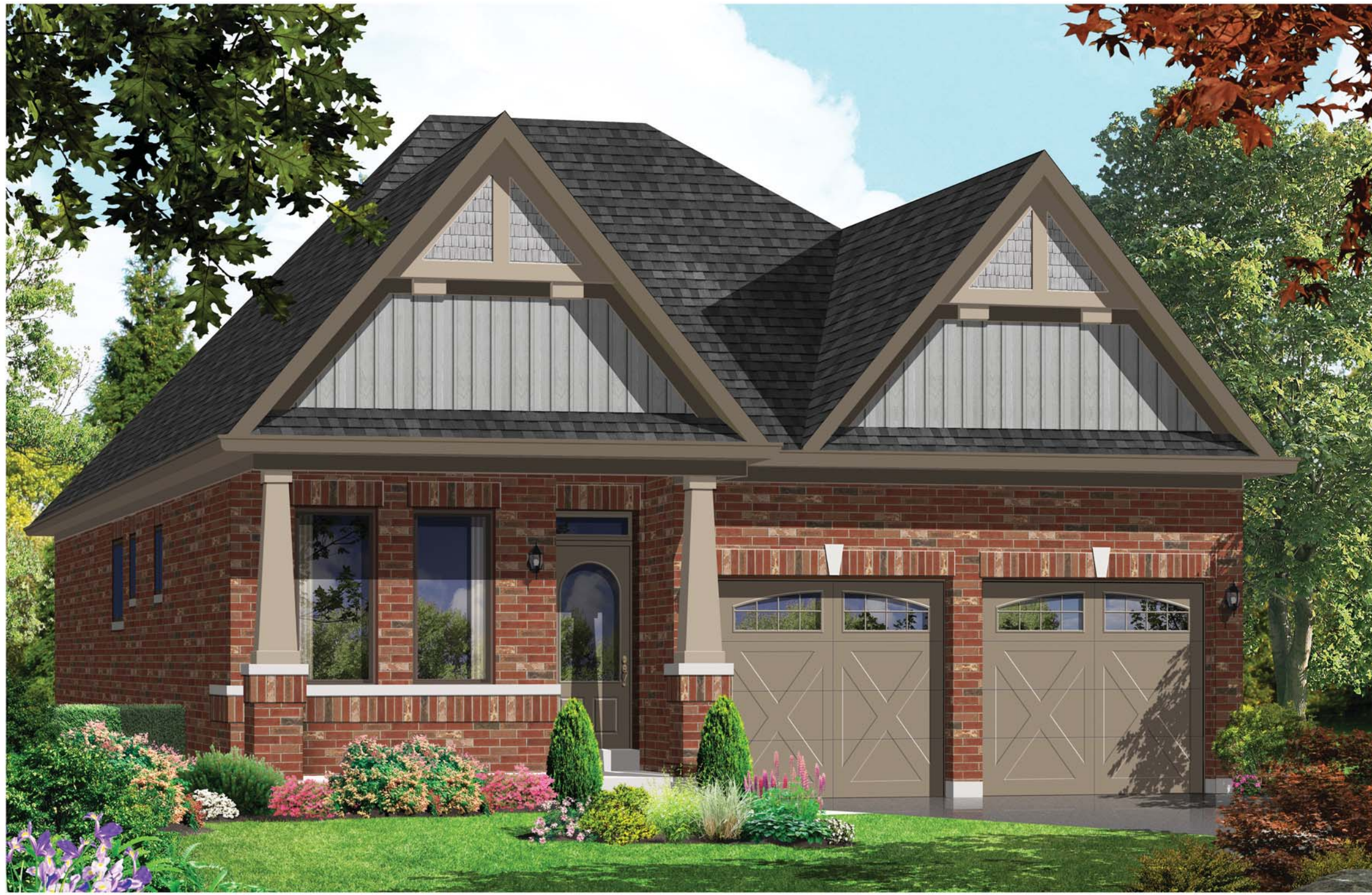
Elevation - B - 1866 sq.ft.